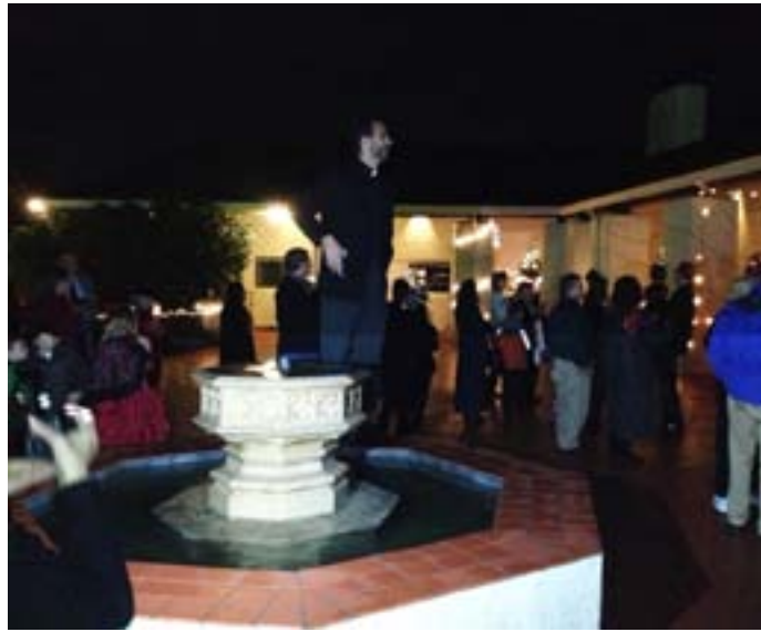
Photos above are from the Community Christmas Celebration on December 23 that preceded the production of "A Christmas Carol."